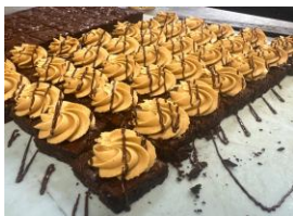
Brownie Bites w/Rosette of Dulche de Leche