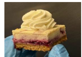
Berry Cheesecake Bar